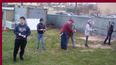
Learn About Fishing