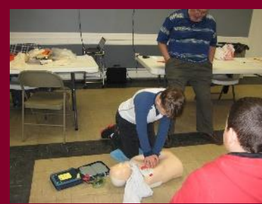
Emergency First Aid