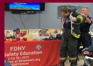
NYFD Fire Safety