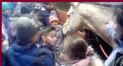
Visit a Horse Stable